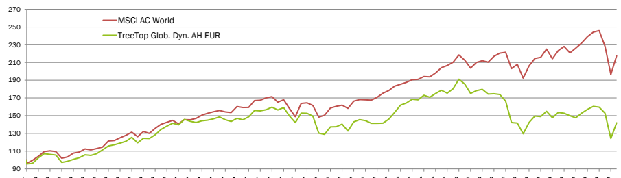
NAV evolution of TreeTop Global Dynamic AH EUR vs. MSCI All Country World* since 2011